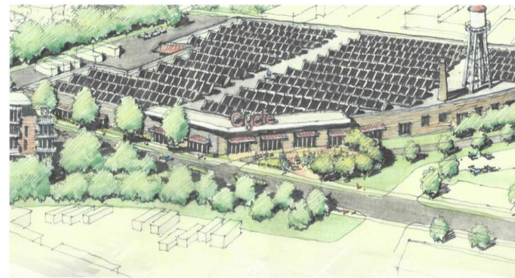
EAST PHILLIPS COMMUNITY PLAN

Also, get active in EPIC , the East Phillips Improvement Coalition, Support EPNI , Write letters to our 'City Leaders' . Why must we bear the burden of more Pollution?